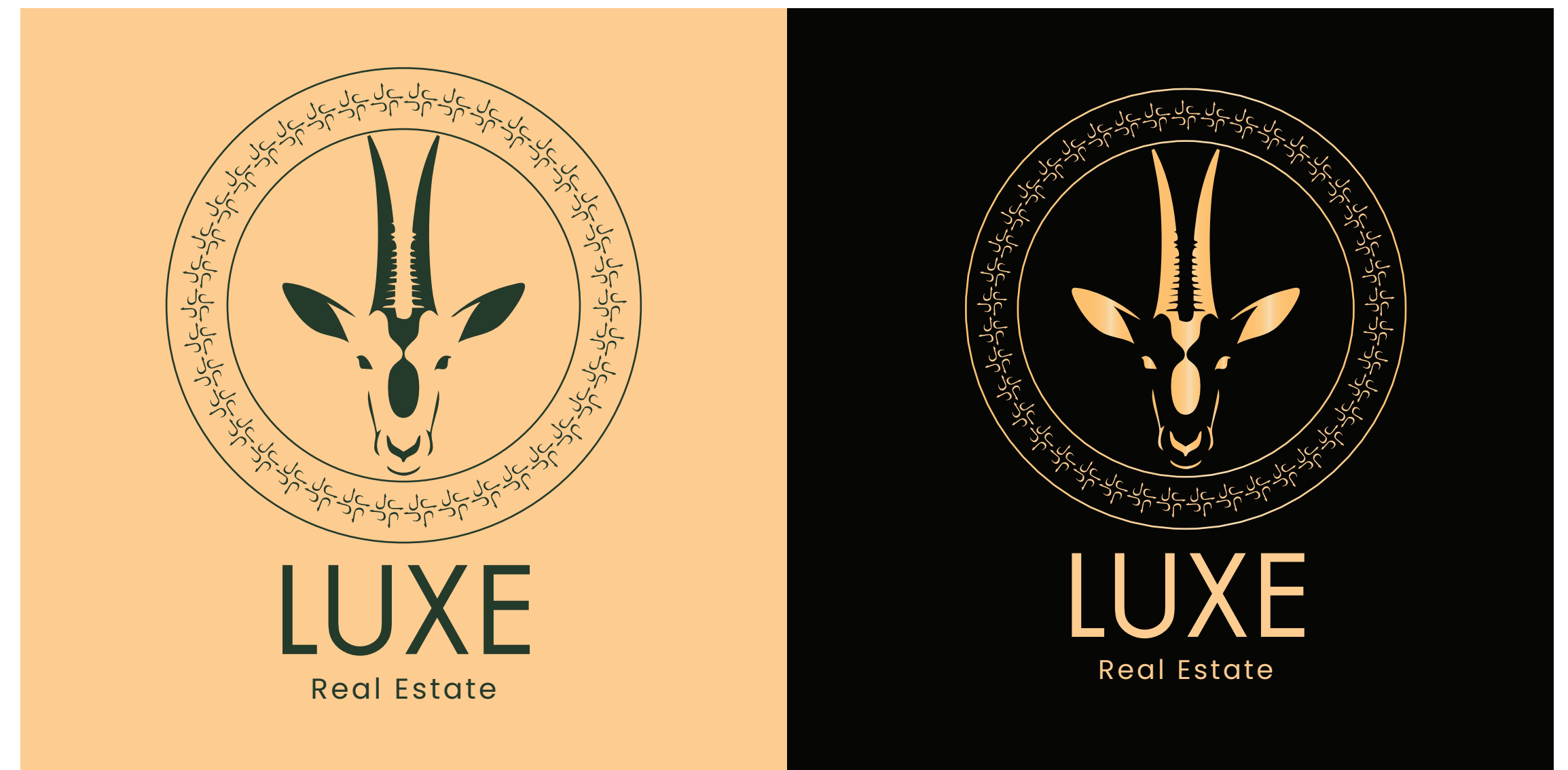
Secondary (Dark Green on Gold) For luxury print applications