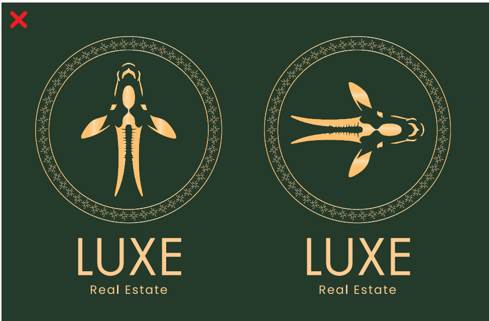
Don't rotate the logo.