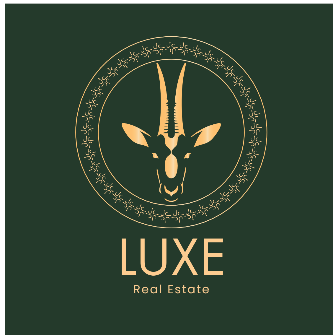
Primary (Gold on Dark Green) Standard version for premium brand use