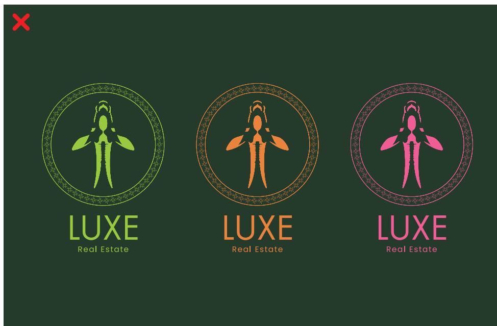
Don't use colours other than those specified in this document.