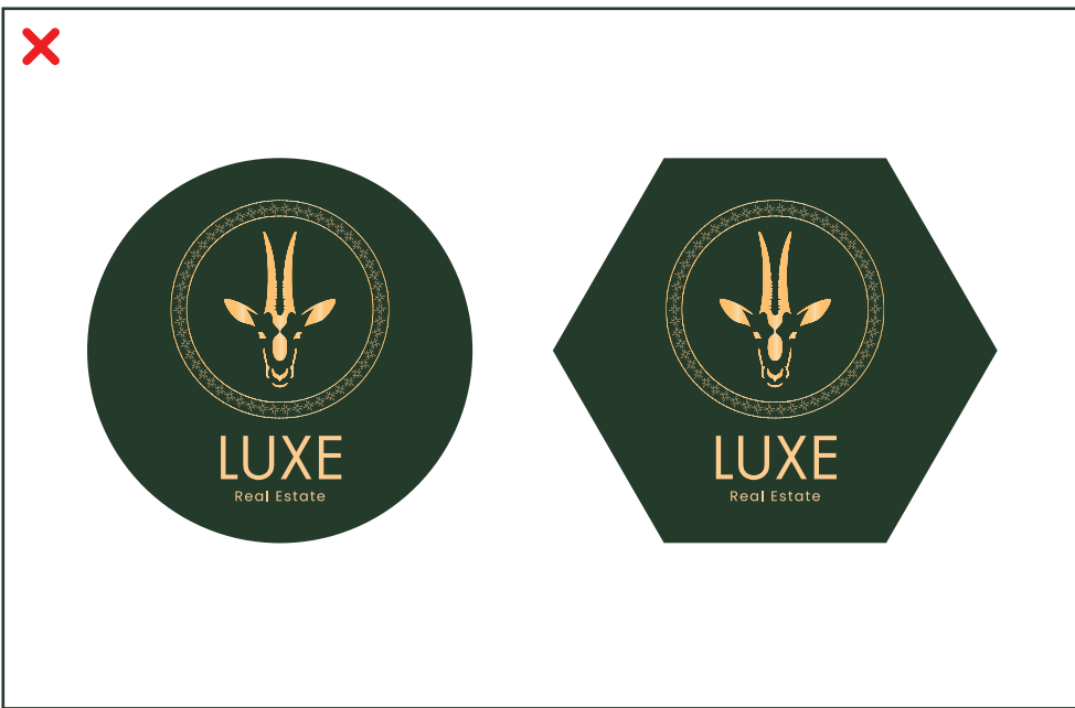
Don't place the logo on a shape other than permitted.