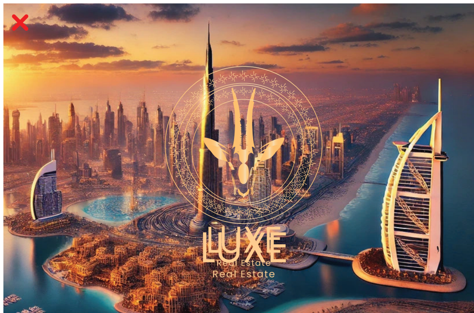
Don't place the logo directly on the busy background.