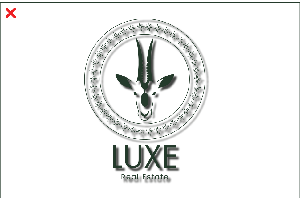
Don't add effects (shadow, gradient, outline).