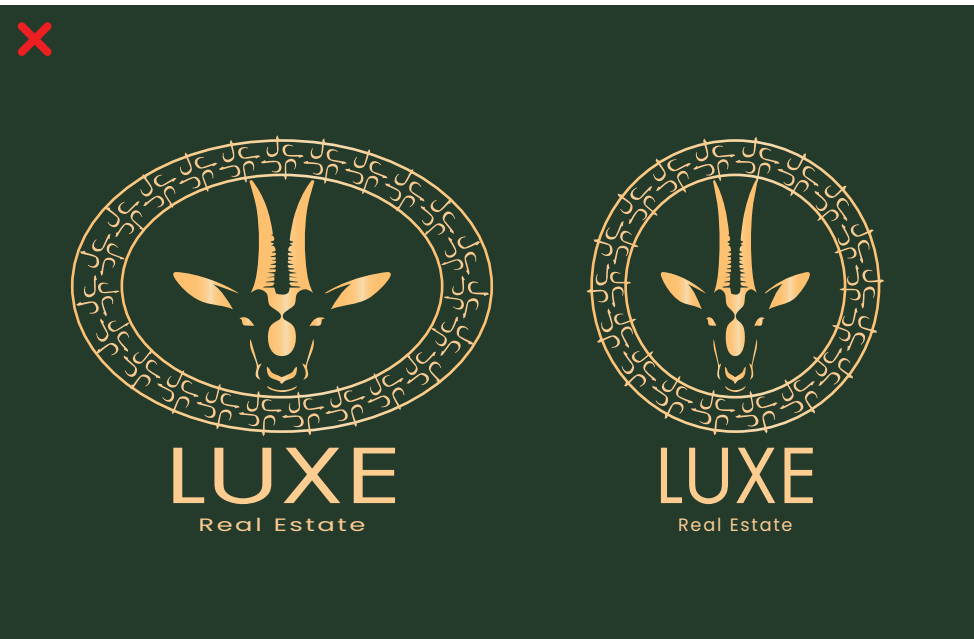
Don't stretch, condense or change the dimensions of the logo.